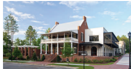
3-story, Corporate HQ for US Steel Real Estate located in The Preserve, Hoover, AL. Completed in 2012.