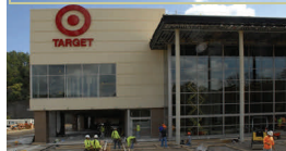
New construction of 2-story Target store at Brookwood Mall in Birmingham. Scheduled for completion in early 2013.