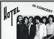
HOTEL IN CONCERT Jasper City Auditorium Friday, January 5 8:00 P.M. TICKETS: $4.00 (advance) $4.50 (day of show) Advance tickets available at: Marcus Sleep Shoppe & Furniture - Downtown Jasper Clay & Cole - Parkland North, Jasper

Loved this sign we saw in Eureka, CA. Never thought about something like this before but I can promise everyone I would be on-the-hoof just like the little man on the sign, and I'm guessing with the exact same expression if ever in this situation.